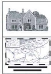
Image on front and new address on reverse with large location map.