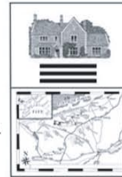
Image with new address on front and large map on reverse.