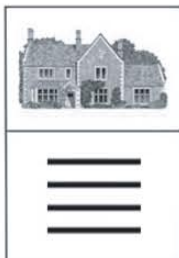
Image on front and new address on reverse.