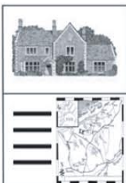
Image on front and new address on reverse with location map.