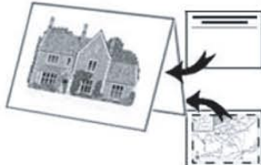
Image on front and new address inside and location map on rear.